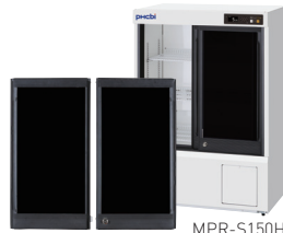
MPR-150GH Shading glass door