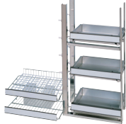
MPR-31RR Wire shelves (left), Sliding racks (right)